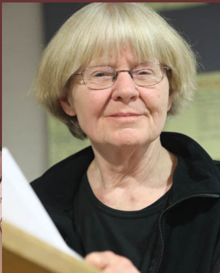
Bottom: Derry Radical Book Fair.

A number of notable events of labour history interest took place in the north west recently, including book fairs, book launches and talks and lectures on various themes.